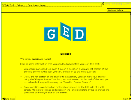
Black on yellow

Here are a few of the text and background color combinations you can choose from on your 2014 GED® test. Click here to see all available color combinations.