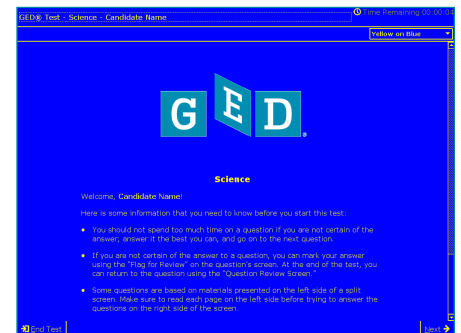
Yellow on blue